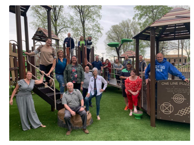
2022 STAR Affiliates in attendance at Breakfast in the Park - our Affiliates are the BEST!

If you missed this years event, plan to attend in May of 2023!