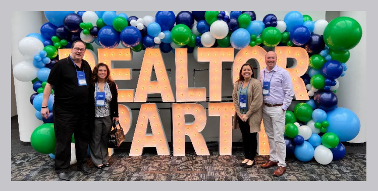
LET'S LEAD OUR ASSOCIATION TO GREATNESS

This month has flown by! I officially have one month here under my belt, and I am learning so much! From attending various training such as Ohio REALTORS Winter Conference to the Party Training to representing STAR at legislative events, I am bursting at the seams with REALTOR knowledge to be YOUR voice. We have been hard at work planning upcoming events about which we are excited!!